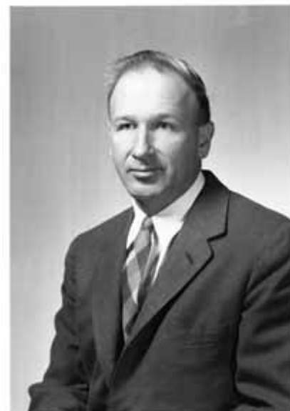
Edward Lorenz 1956

Whilst he is best known for his work on Chaos Theory , he made very valuable contributions to other areas of mathematics including climate theory.